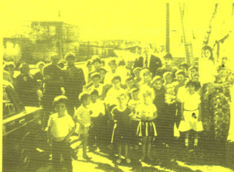
Armenian Village Children: Their Only Hope Is Christ! "Suffer Little Children, And Forbid Them Not, To Come Unto Me; For Of Such Is The Kingdom Of Heaven." Matt. 19:14

a prayer of repentance with me. Afterward, I was told that this was the first time that a village had received the gospel on the first visit. Paul said, "I am not ashamed of the gospel, for it is the power of God, unto salvation."