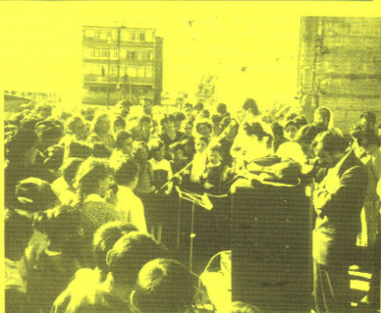
Leading The Young As Well As The Old In A Prayer Of Repentance. Their Hearts Were So Open To The Message Of Christ!

I went with the two students that I would be sponsoring up to the city of Sevon. Here there was a thriving church with around seven hundred members. From this city, we would travel to various villages where new churches were being planted. On Saturday, I went to a village with no church and from my understanding, where there had been no ministry before. I preached the gospel after our Students had sung and shared with the people our reason for being there. When I asked how many wanted to truly know Jesus as their Lord and Saviour, around sixty came forward. I asked them to pray