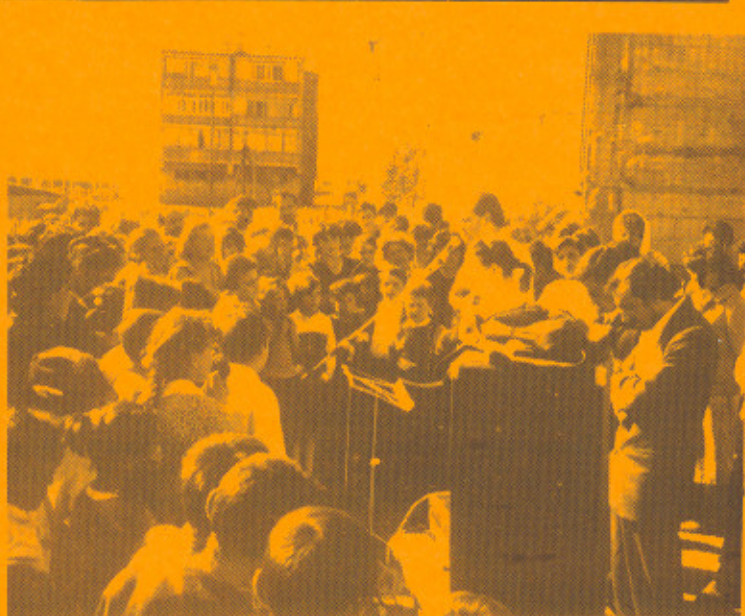
Leading The Young As Well As The Old In A Prayer Of Repentance. Their Hearts Were So Open To The Message Of Christ!

I went with the two students that I would be sponsoring up to the city of Sevan. Here there was a thriving church with around seven hundred members. From this city, we would travel to various villages where new churches were being planted. On Saturday, I went to a village with no church and from my understanding, where there had been no ministry before. I preached the gospel after our Students had sung and shared with the people our reason for being there. When I asked how many wanted to truly know Jesus as their Lord and Saviour, around sixty came forward. I asked them to pray