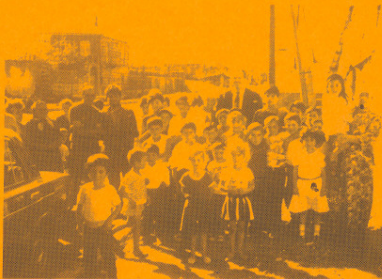
Armenian Village Children: Their Only Hope Is Christ! "Suffer Little Children, And Forbid Them Not, To Come Unto Me; For Of Such Is The Kingdom Of Heaven." Matt. 19:14

a prayer of repentance with me. Afterward, I was told that this was the first time that a village had received the gospel on the first visit. Paul said, "I am not ashamed of the gospel, for it is the power of God, unto salvation."