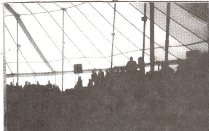
Preaching To The Hundreds Gathered In Under The Tent In Obninsk Russia

This was my third trip to Russia in six months and each trip has been different, exciting and to put it mildly, quite challenging. There is such a hunger for spiritual things that sometimes it boggles the mind. Some come to the meetings out of curiosity, but many come because of a sincere desire to know more about the God who was kept from them for seventy years.