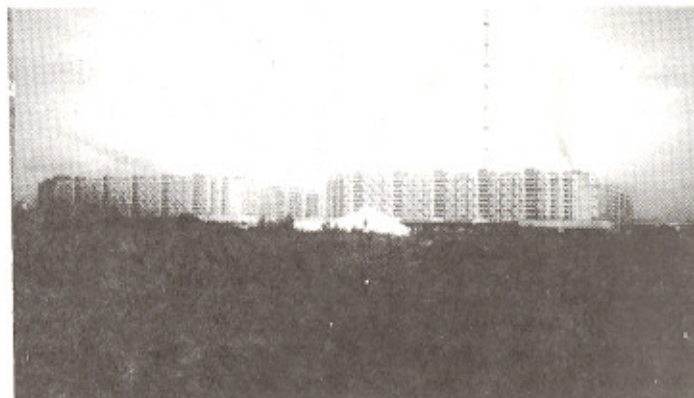
The Tent Was Surrounded By These High Rise Apartment Buildings On Both Sides. Thousands Could Have Listened From Their Balconies.

concerned that they would be harder to reach with the gospel than the poorer class people. Most of these were probably communist before the iron curtain fell. It was a true spiritual battle, but God gave the victory!