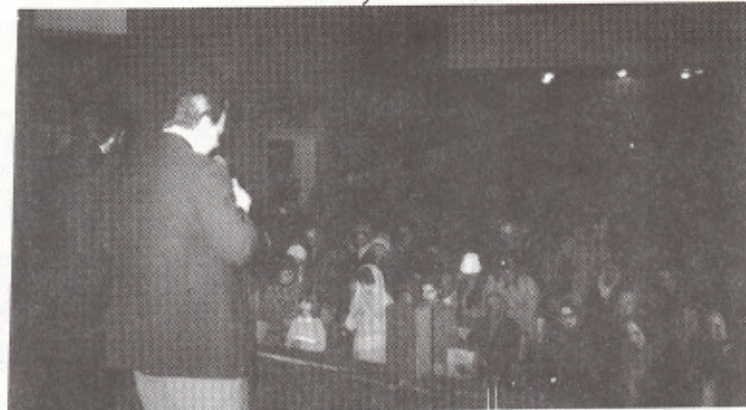
A Partial View Of The Hundreds Standing To Receive Christ In The City Of Kursk.

After having traveled and preached the gospel in several countries of the world, I can honestly say I have never seen anything quite like the hunger for God in the former Soviet Union. After having been refused boarding on the train to Kursk, we looked to God (myself, my interpreter and one of the former Bible School students), and was able to secure tickets for a 1:45 a.m. departure to our first crusade city of 750,000 people. The conditions on the train were deplorable and once I thought a little dangerous, but the Lord was about to give a great harvest. After an all night train ride we arrived in Kursk and began a three day crusade.