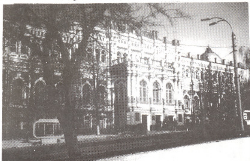
I Preached For Three Days In This Great Cultural Hall With Seating For A Thousand People.

After having traveled and preached the gospel in several countries of the world, I can honestly say I have never seen anything quite like the hunger for God in the former Soviet Union. After having been refused boarding on the train to Kursk, we looked to God (myself, my interpreter and one of the former Bible School students), and was able to secure tickets for a 1:45 a.m. departure to our first crusade city of 750,000 people. The conditions on the train were deplorable and once I thought a little dangerous, but the Lord was about to give a great harvest. After an all night train ride we arrived in Kursk and began a three day crusade.