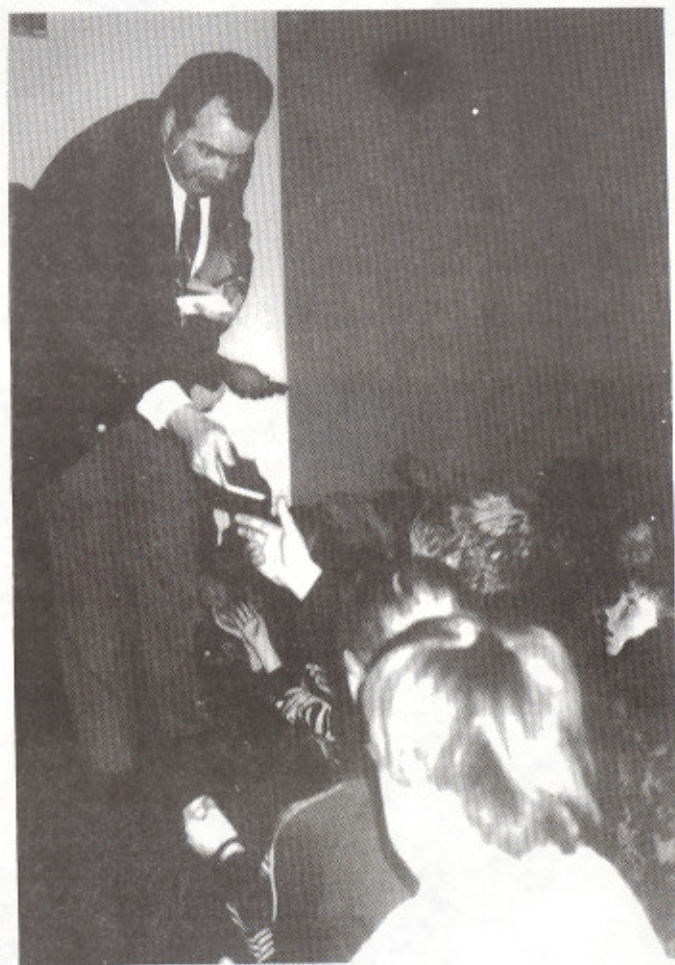
Here I Am Giving Out New Testaments. An Estimated 1,500 Were Given Out In The Kursk Crusade Alone.

The people came and with great reverence and anticipation listened to and believed the gospel. I preached five times in three days and around 600 prayed to accept Jesus Christ as Lord and Saviour. The people declared they had never heard anything like this before. They wept openly (the Russians do not display a lot of emotions), and said as they listened to the preaching of God's word they were "pricked in their hearts".