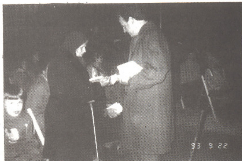
Here I Am Giving A New Testament To An Old Woman. These Bibles Are Cherished!

The first night was cold, but around 200 people showed up. I preached on the subject "Jesus Christ The Saviour, Jesus Christ The Judge", and when the invitation was given, around 75 people came forward to pray the sinners prayer. I prayed for several sick folk that night, and many of the people received New Testaments.