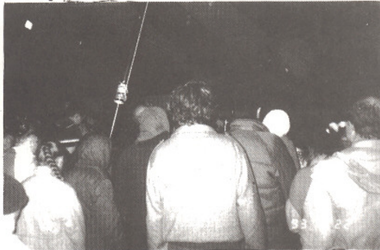
Leading The People In A Prayer Of Repentance. Around 200 Prayed This Prayer For Salvation In The Three Night Tent Crusade.