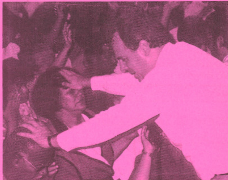
Ministering to the needs of sinner and saint alike. The hunger for God was so great! Tears flowed like a river!

The people filled the front nightly seeking God. I was told that healings took place. I know that lives were changed. In the South American churches the young and young adults outnumber the old. This is quite a contrast to the churches here in the states.