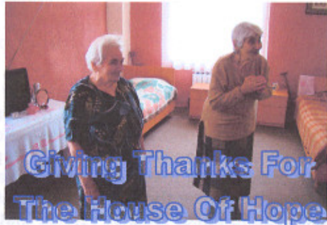
Giving Thanks For The House Of Hope

14 tons of equipment for the Home was shipped over. Hospital beds, wheel chairs, walkers, linens, clothes, shoes, and more!