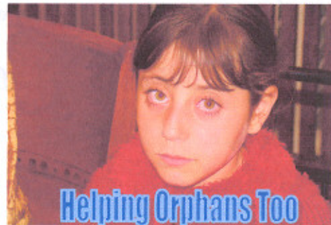
Helping Orphans Too

What a wonderful dedication meal and time of fellowship with the widows and old people in the House Of Hope