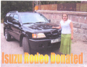
Isuzu Rodeo Donated

Many who saw the building before renovation, thought it could never become useable. With God's help and direction it, now sits like a beacon on a hill.